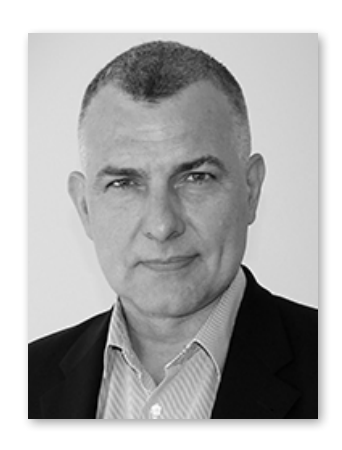
BIMCO Training Bagsvaerdvej 161 DK-2880 Bagsvaerd Denmark

Email: training@bimco.org +45 44 36 68 00 Tel: Web: www.bimco.org