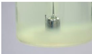
Figure 1: Cloud Point