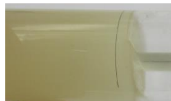
Figure 3: Pour Point

39 The CFPP and the PP can be suppressed by cold flow improving (CFI) additives, whereas the CP cannot be impacted by additives. The difference between CP, CFPP and PP is 3°C to 5°C for untreated fuels, with CP having the highest temperature and PP the lowest. Treated fuels may have a difference as large as 40°C to 50°C.