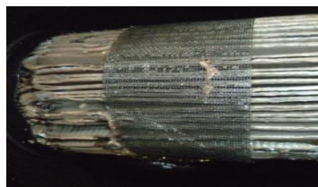
Figure 2: CFPP